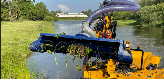
Small Auger Dredge