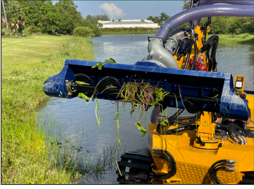
Small Auger Dredge