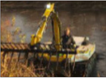
Front Collecting Rake